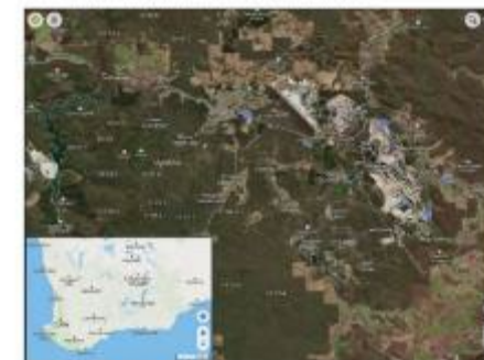
Figure 11: Collie locality in South West Western Australia. Source: https://www.google.com/maps .

The South West Western Australia case study focuses predominantly on the coal mining area around Collie (Figure 11). Mining has taken place in Collie since the discovery of coal in 1883, and the town of Collie is a direct consequence of coal mining. In 1931 the first power station was constructed and as a result of both mining and coal power generation, Collie has become a major contributor of energy for southern part of the state, providing up to 30% of required generation. This coal mining transition case study is supported by the perspectives of research participants whose professional experience relates to other forms of mining transition in the South West, notably mineral sands mining on the coastal plain.